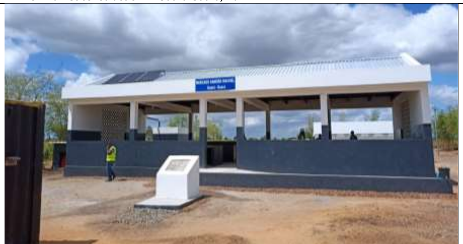
Picture 9 shows front view of newly constructed market in Guara Gura Buzi