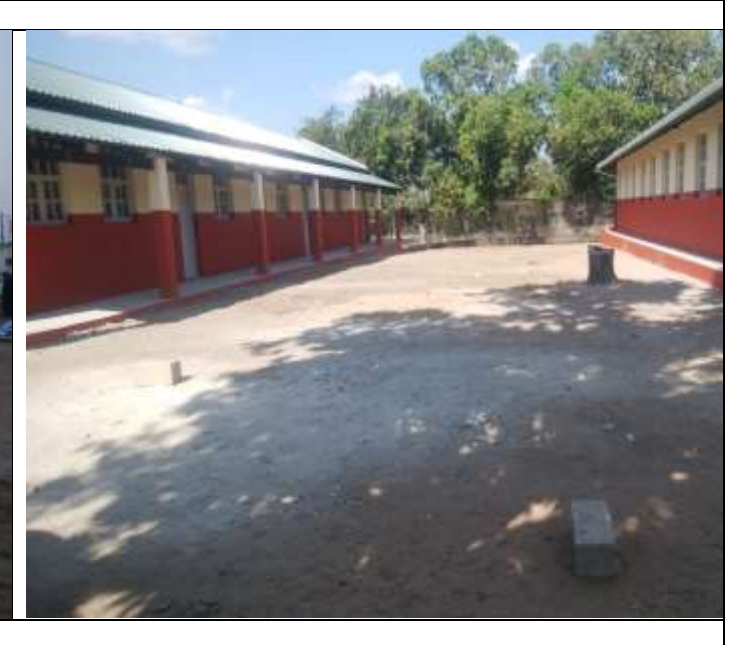
Picture 1 and 2 shows that the newly constructed two school blocks in Chipinde, lot4 Dondo district.