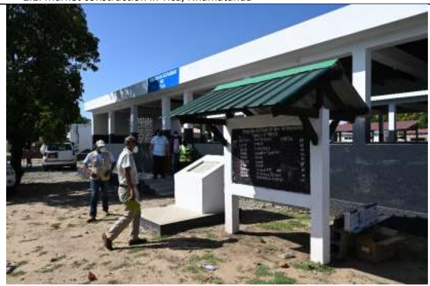
Picture 1 shows front view of newly constructed markets in Tica, Nhamatanda

2.1. Market construction in Tica, Nhamatanda