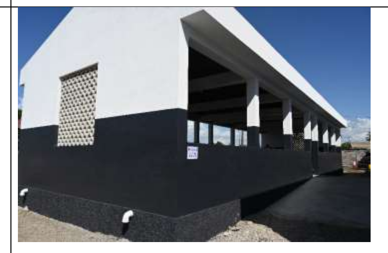
Picture 4 shows side view of another market block in Tica, Nhamatanda