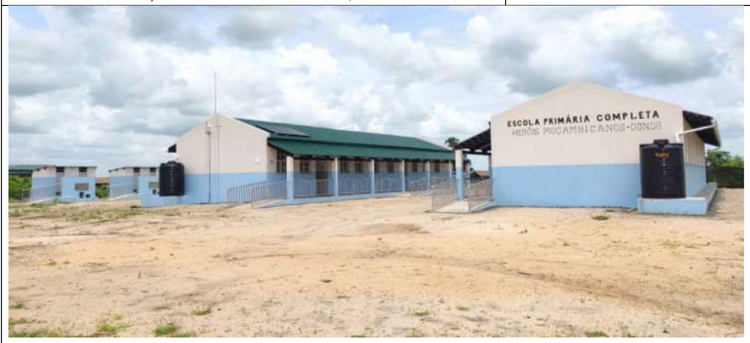
Picture 6 shows that the new constructed school building with gender friendly to ilets in Mutua school lot 4, Dondo district.

1.3 lot1: Chicuacha primary school, Chibabava district