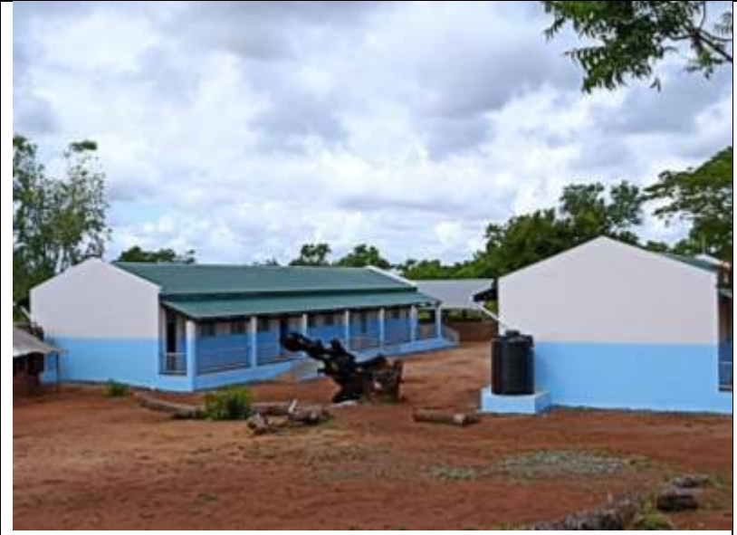
Picture 13 shows newly constructed schools in Heua, lot2, Chibabava district.