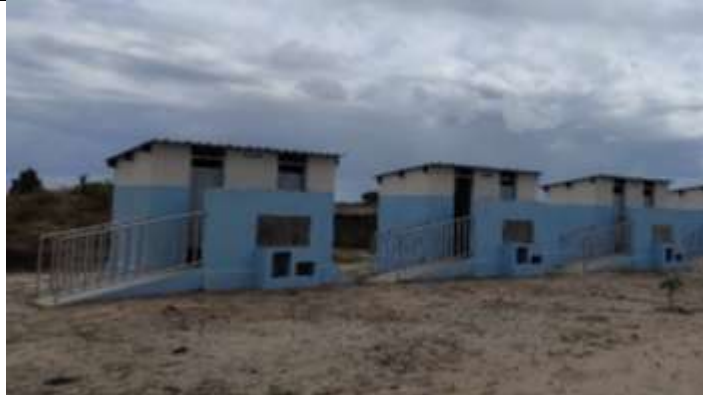
Picture 5 shows that the new constructed gender and disable friendly toilets in Mutua school lot4, Dondo district.