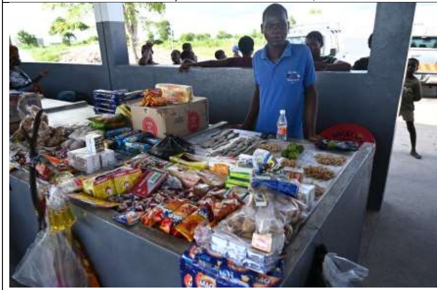
Picture 3 shows local beneficiaries were selling their goods in Tica, Nhamatanda