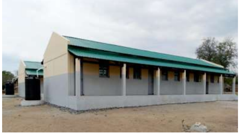
Picture 10 shows that the newly constructed school block-1 with gender friendly toilet behind the school in Madombatomba, lot1, Chibabava district.