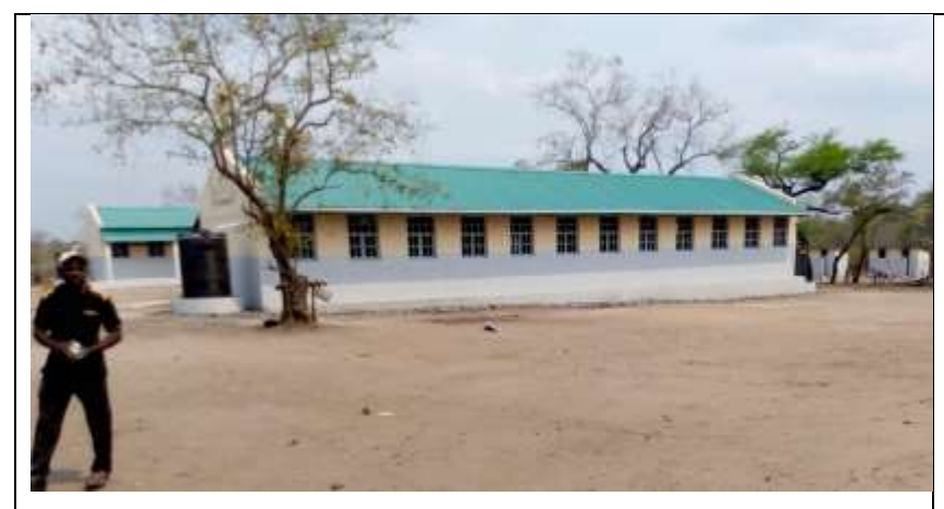
Picture 7 shows that the newly constructed school block-1 with gender friendly toilet behind the school in Chicuacha, lot1, Chibabava district.