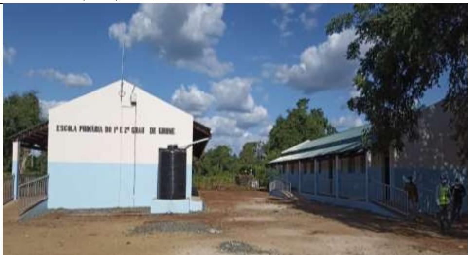
Picture 17 shows newly constructed schools in Girome, lot3, Chibabava district.

1.8 lot3: Armando Emilio Guebuza primary school, Chibabava district