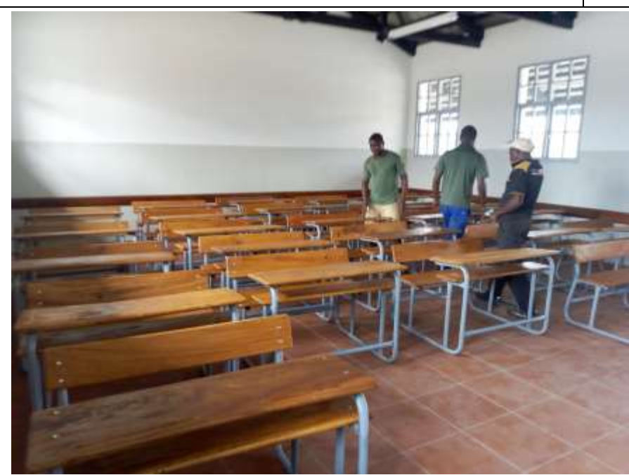
Picture 12 shows that setting of new furniture inside the classroom in Madombatomba, lot1, Chibabava district.

1.5 lot2: Heua primary school, Chibabava district