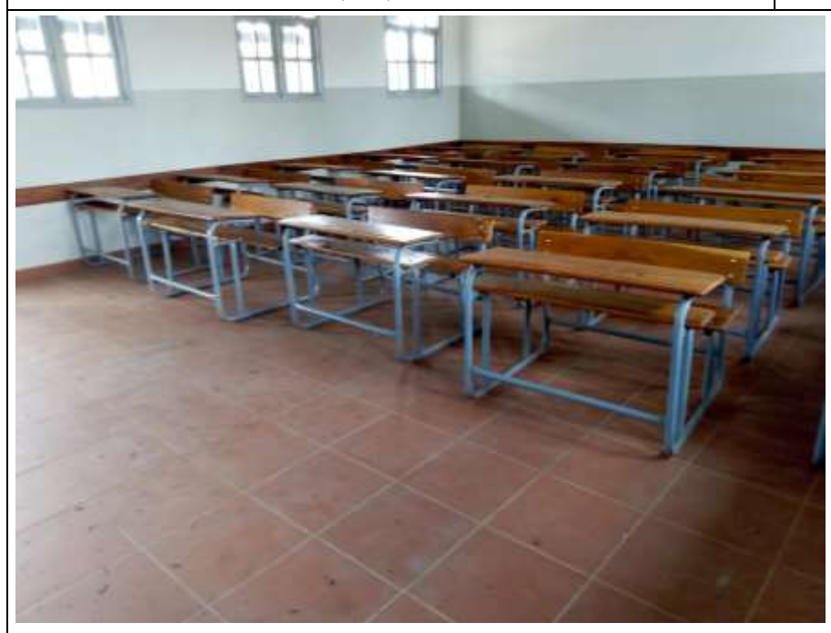
Picture 9 shows that the new furniture is well set inside the classroom in Chicuacha, lot1, Chibabava district.

1.4 lot1: Madombatomba primary school, Chibabava district