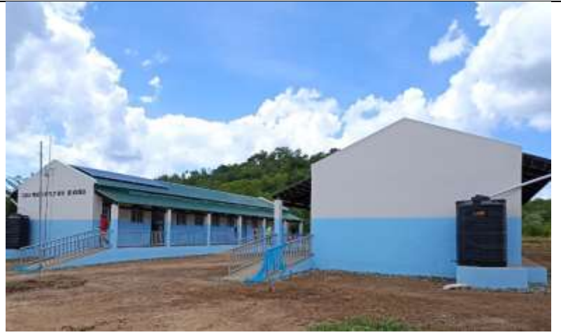
Picture 15 shows newly constructed schools in Muconja, lot2, Chibabava district.

1.6 lot2: Muconja primary school, Chibabava district