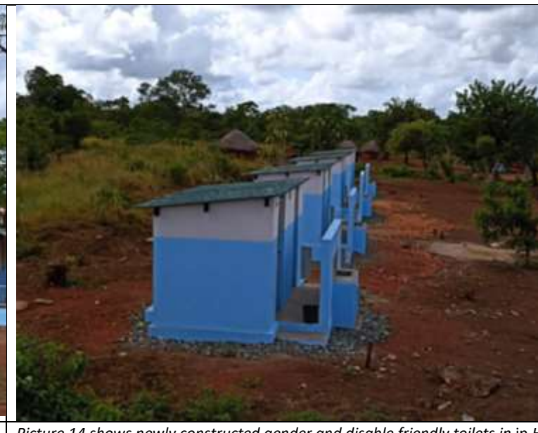
Picture 14 shows newly constructed gender and disable friendly toilets in in Heua, lot2, Chibabava district.

1.6 lot2: Muconja primary school, Chibabava district