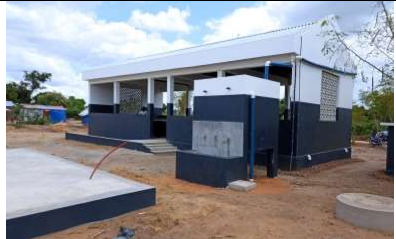
Picture 10 shows isometric view of newly constructed market in Guara Gura Buzi